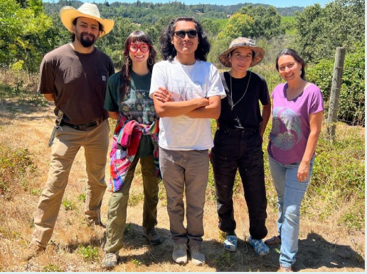
Watch the video to experience a little more of 2022 at Heron Shadow!