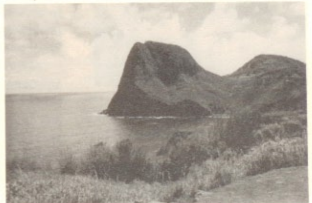
The wild West Maui coast

CARE PROJECT: A diabetes program funded by the Wellness Foundation and the San Francisco Foundation to address the high incidence of diabetes in the Samoan community. We are entering our second year of funding and are stunned by the enormous need in this area not only for the Samoan community but also the