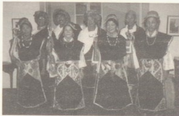
Tibetan Elders in the Presidio Chapel

In February and March, TCC produced the Tibetan New Year Celebration with public events at the Presidio Alliance, Interfaith Chapel, and new Crissy Field Center in the Presidio of San Francisco. We successfully brought ten Tibetan elders from refugee camps in southern India to San Francisco to sing,