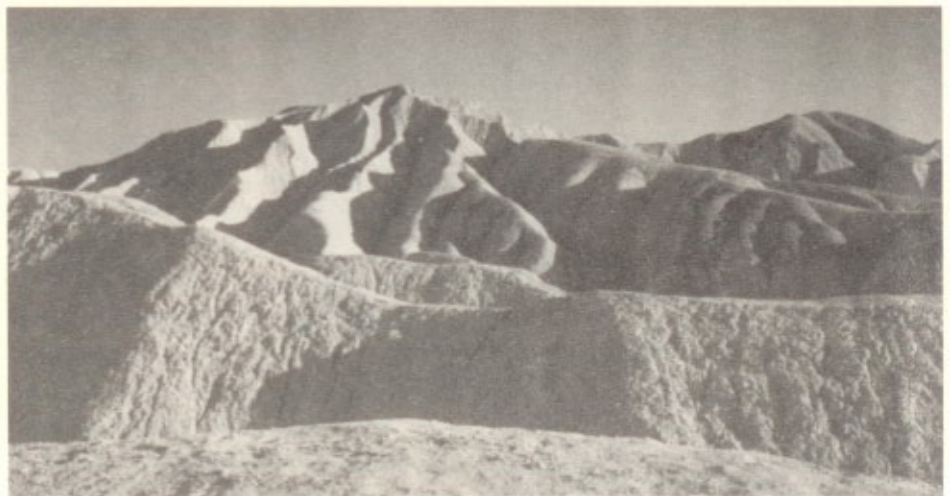
Death Valley National Park, Ancestral Homelands, recently returned to the Timbisha Shoshone

There's an old and common saying among many native peoples, "you can't have culture without the land, you can't have the land with-